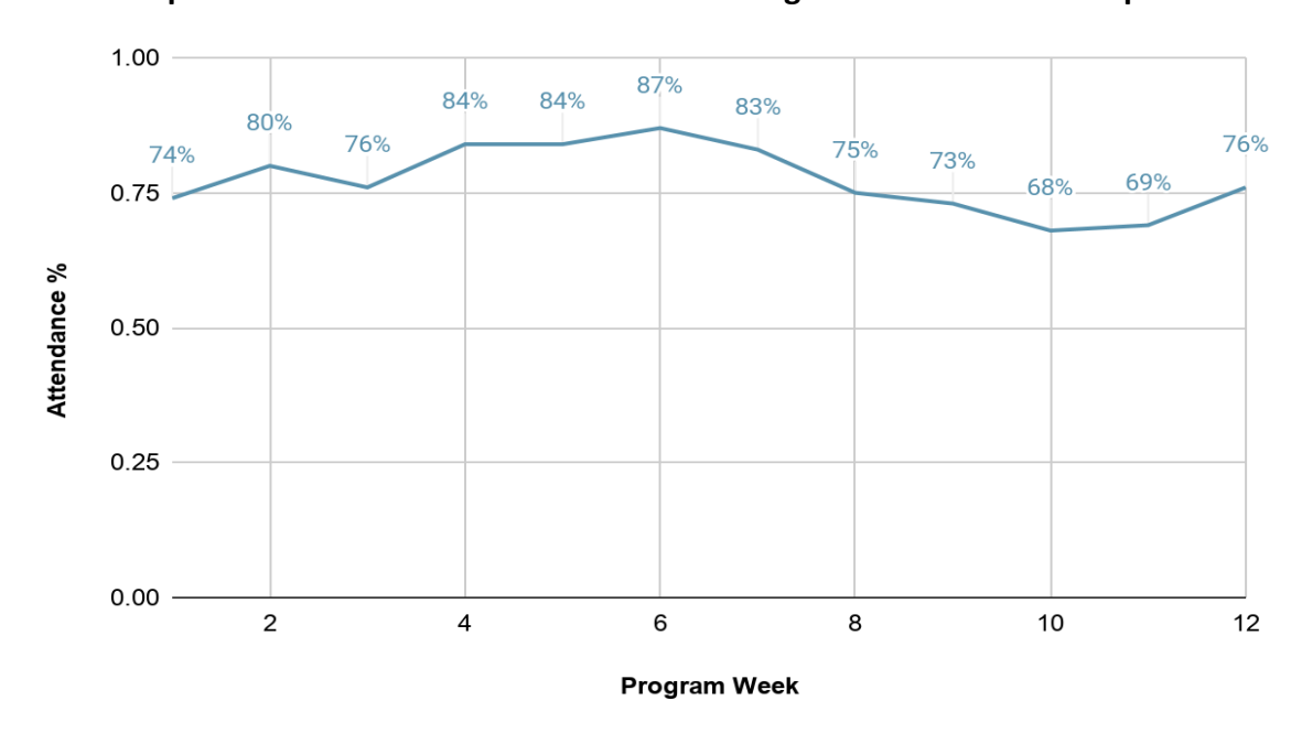
Graph 1: Trends in learners' attendance through the 12 weeks of the pilot

In addition to pupil attendance, parents engaged in listening centre activities more than originally expected, and their engagement increased over time. Parental attendance during radio shows was on average 23.5% at week six and grew to 35% at week 12, a sign of their increased interest and support of the program.