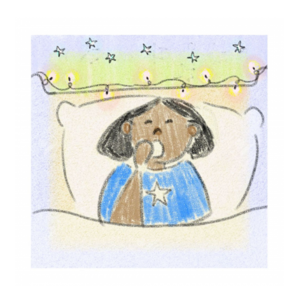
But all through the night, Lesedi, tosses and turns, she doesn't sleep a wink.