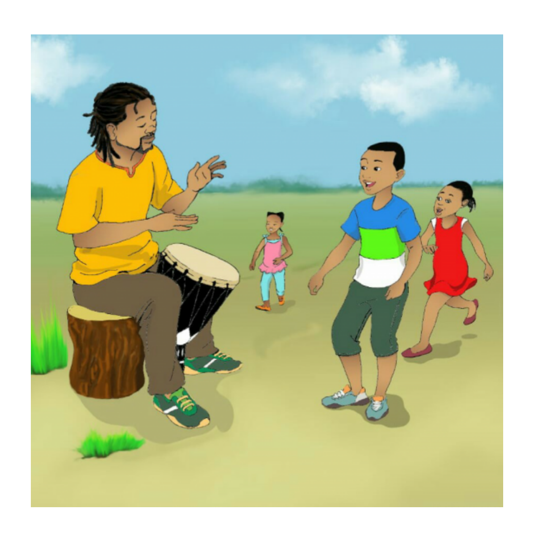
Children gather around him.